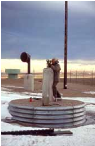
Shooting an angle

There were three "monuments" located around the LF, as described last issue by Bib Kelchner. Monument A (also called station A when we had a theodolite mounted) was located adjacent to the launcher closure door track. The other two monuments were outside the fence in farmers fields and were several hundred feet apart. A monument consisted of a concrete pillar about 4 ½ feet tall (above the base) and about 18" in diameter,