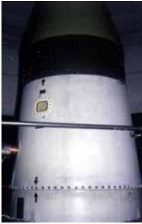
MMII G&C with alignment window

reference mirror was about a foot in diameter, two to three inches thick, and what was called a “first surface mirror.” This meant that the reflecting surface was on the outer layer of the mirror, unlike ordinary mirrors that have clear glass over the reflecting surface. This allowed for an undistorted reflection. The mirror was very precisely ground. It was intended that the mirror could not move, and also very important not to touch the surface of the mirror.