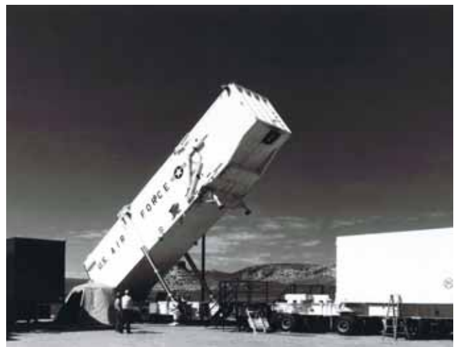
Peacekeeper missile installation

With the end of the Cold War, further discussion in the Executive or Legislative branches of the American Government on deploying the MX missile in any form other than the 50 weapons placed in fixed-silos ended. Ultimately, the decision on how to base the MX ICBM came down to deploying the missiles in the least survivable as well as the least expensive basing mode, that is, the placement of the MX missiles in existing Minuteman launch facilities, or else to scrape the new missile altogether because the Executive and Legislative branches could reach a consensus. After ten years of debate, this basing option was the only one that could enjoy Congressional approval. In the end, the MX missile system was operationally deployed in Minuteman launch facilities for almost twenty years, deactivating in 2005, thus ended the complicated history of the MX ICBM.