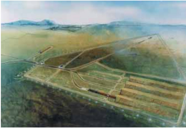
MX Basing Concept