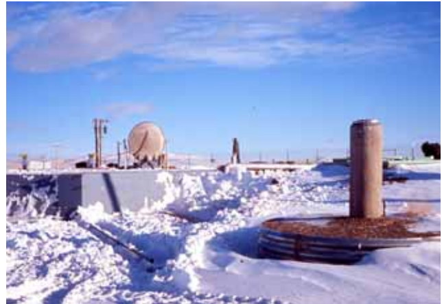
Alignment in Winter on the Northern Tier

Send us your stories, photos and memories about your experiences in competition. We will commemorate the 40th anniversary of the first Missile Competition, Curtain Raiser, with a review of all 40 years from members who participated in the "Comp." Send by e-mail or mail.