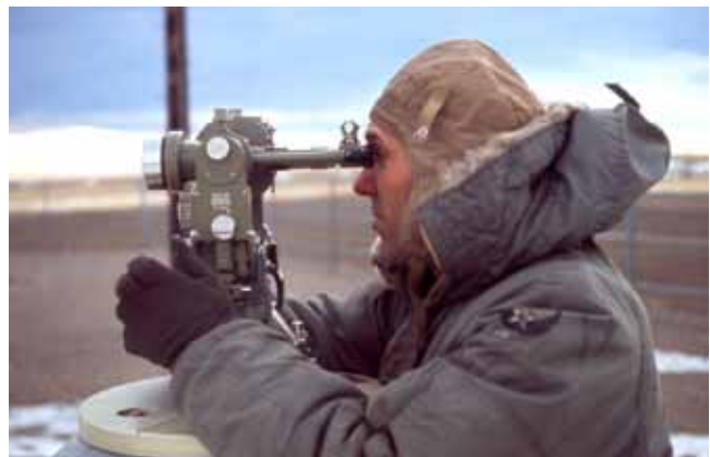
Cold Weather Theodolite Sighting