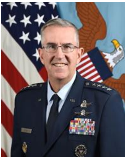
Gen. John E. Hyten, USAF

Gen. John E. Hyten, USAF, serves as the 11th Vice Chairman of the Joint Chiefs of Staff. In this capacity, he is the nation's second highest-ranking military officer and a member of the Joint Chiefs of Staff.