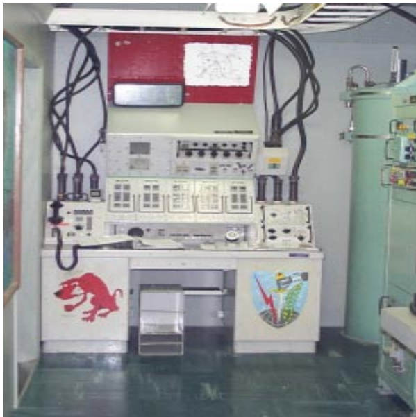
Minuteman I Console at Malmstrom Museum